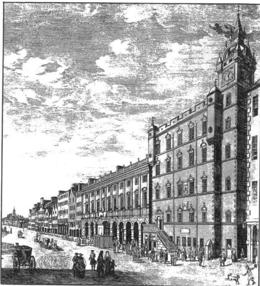
A view of the Frontale of Glasgow from the East