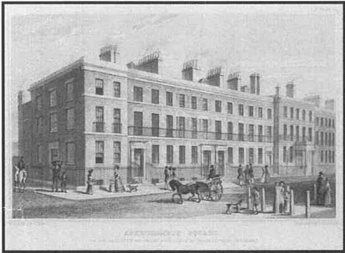
Figure 1 Laid out in neoclassical style in the 1810s, Abercromby Square was named after Scottish soldier and politician Sir Ralph Abercromby (1734-1801), Governor of Trinidad and Commander-in-Chief in Ireland. Abercromby was fatally wounded at the Battle of Alexandria in 1801. Originally laid out as residential terraces, the Square is now home to the University of Liverpool's humanities departments, including History, English, Irish Studies, Modern Languages and Archaeology, Classics & Egyptology.